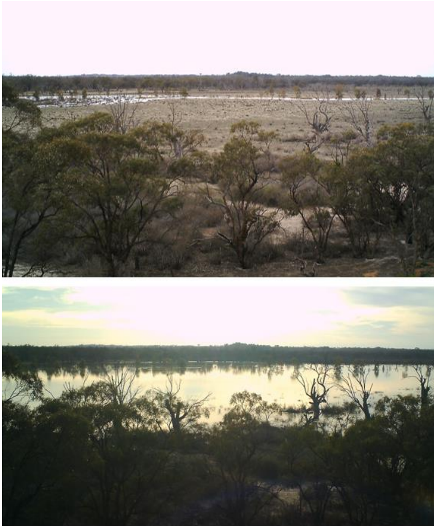
Figure 2: Before and during environmental watering on the Katarapko Floodplain in 2020 (DEW)